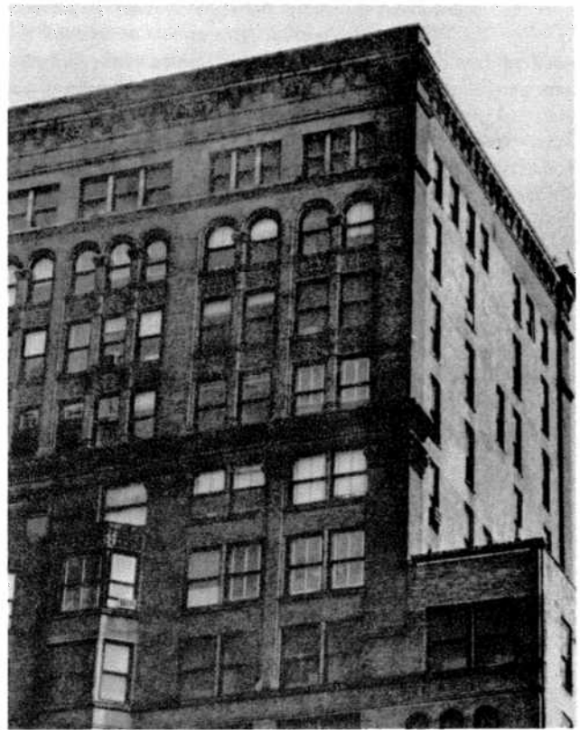
The design of the Manhattan strongly reflects Jenney's engineering background; the step-like profile represents an attempt to lessen the weight of the Manhattan on the adjacent buildings.

stood at 200-08 West Monroe Street and was demolished in 1972. The first Leiter Building contained a relatively large amount of window area for a structure of that period and was said to be "very nearly a glass box." The building was supported partially by an internal iron structure and only partially by masonry walls. It was almost entirely devoid of ornament and as such was remarkable stylistically as well as structurally.